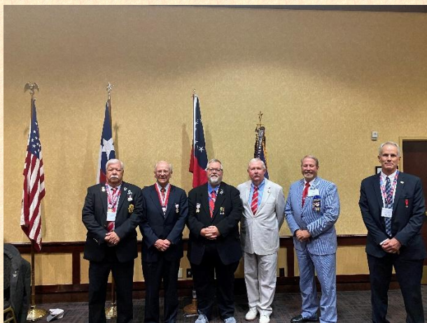
New Officers of the Texas Society, MOS&B