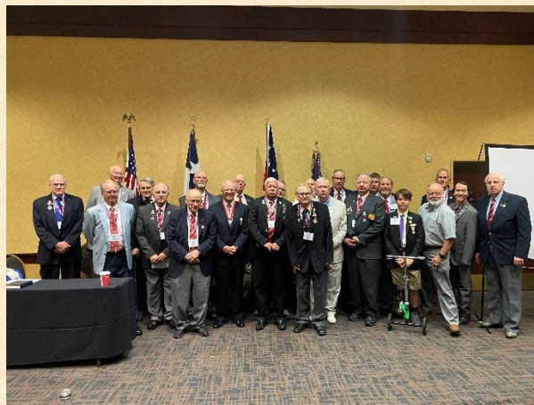
All Texas Society member who attended the Convention!